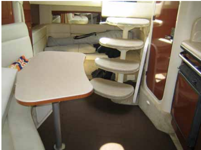
Photo 23. Dinette to starboard looking aft from forward cabin.