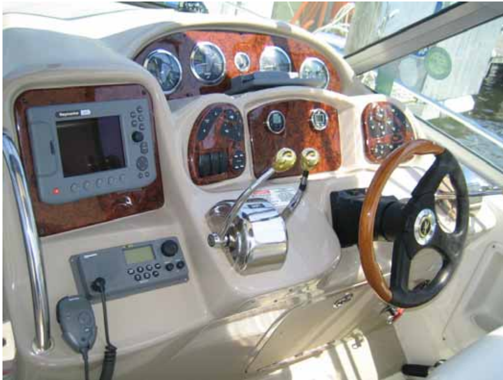
Photo 7. Helm.

Engine controls are push-pull cables at the helm and operated smoothly.