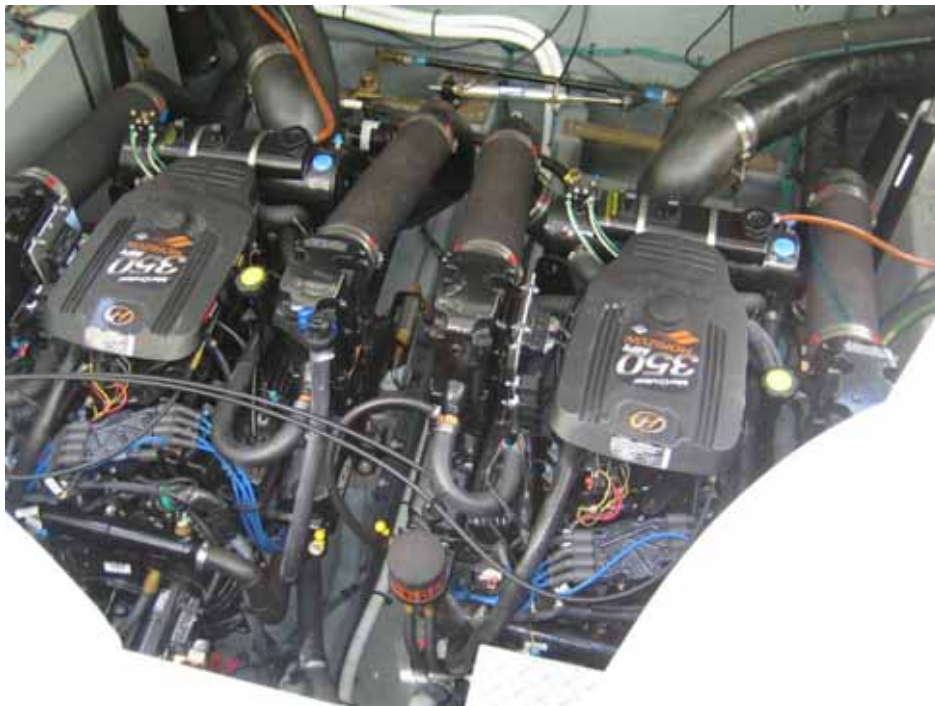
Photo 11. Engine room.