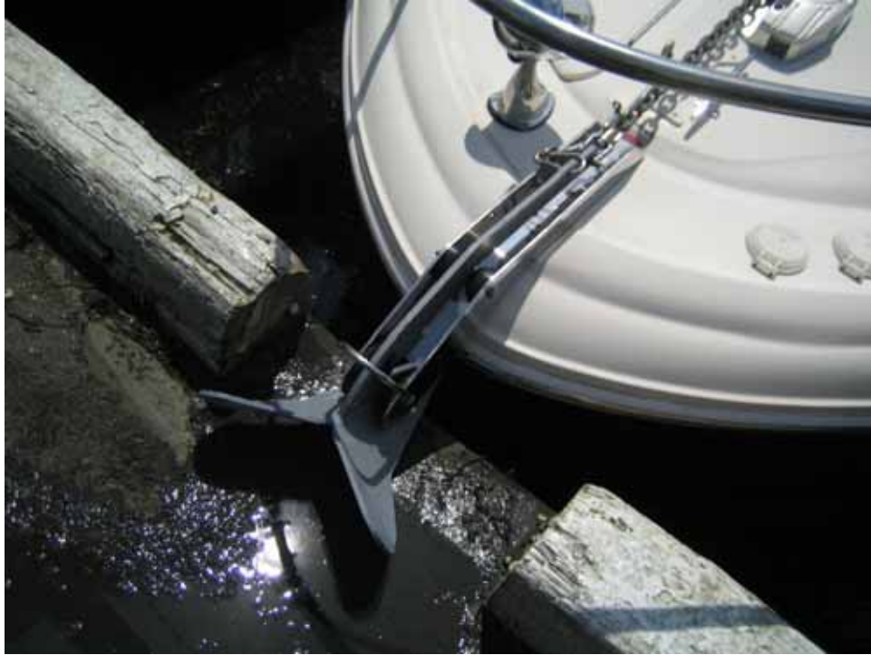
Photo 10. Delta style plow anchor and bracket.