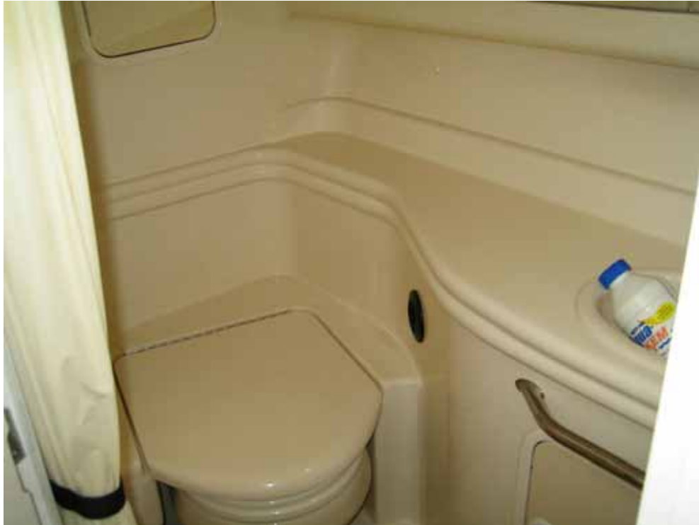
Photo 24. Head to port.