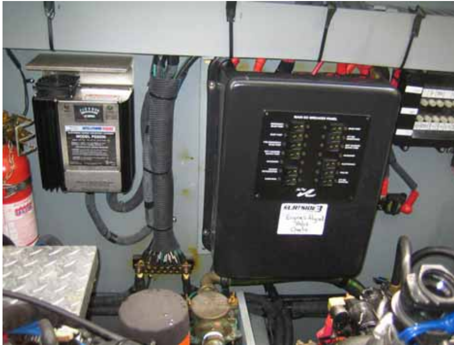
Photo 15. Intelli-power 30A battery charger to left, DC main panel to right.