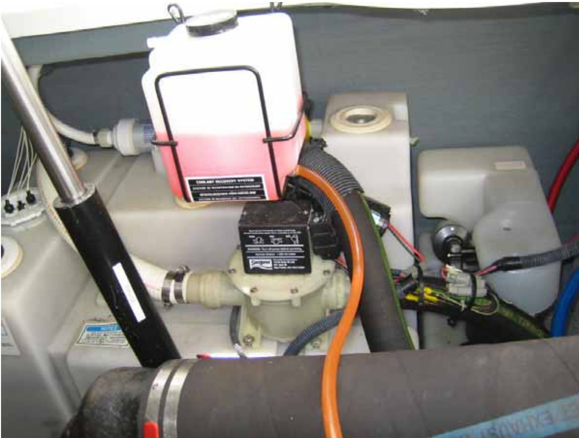
Photo 14. Vacuflush system and water tank to port in engine room.

An Atwood 120 VAC hot water heater with heat exchanger was noted to port in engine room and tested working.