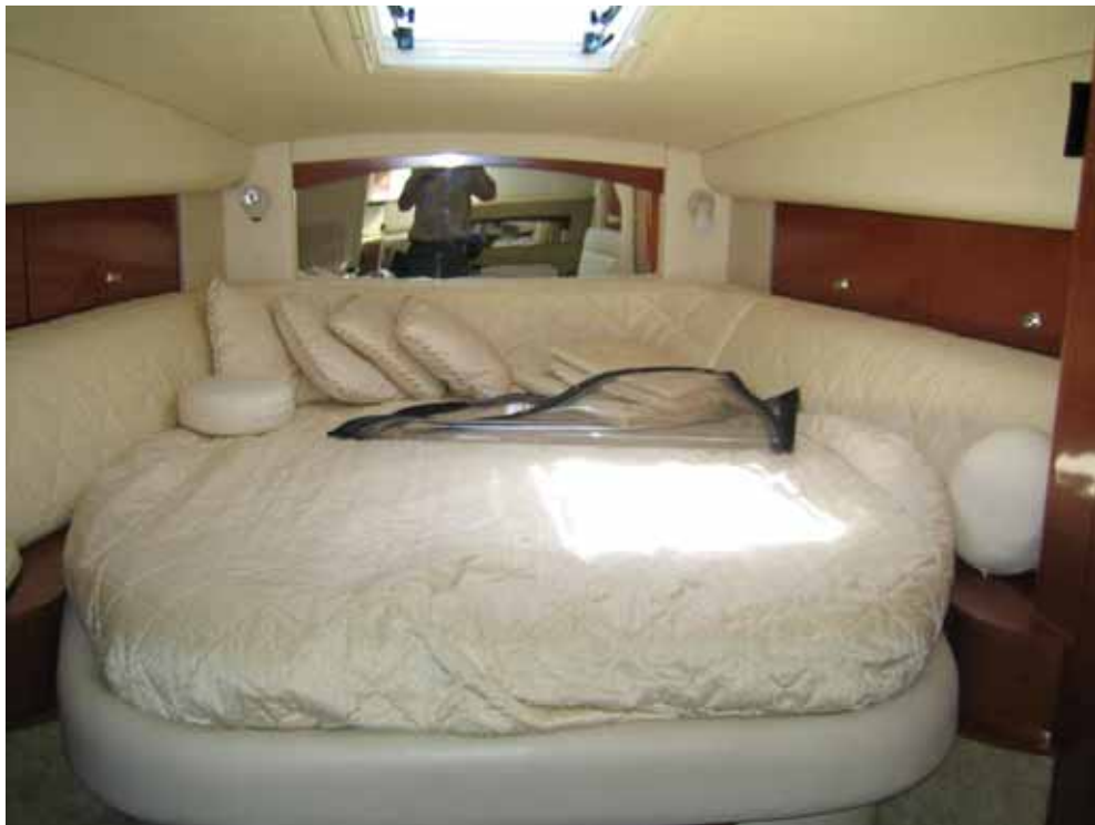
Photo 25. Owner's berth forward.