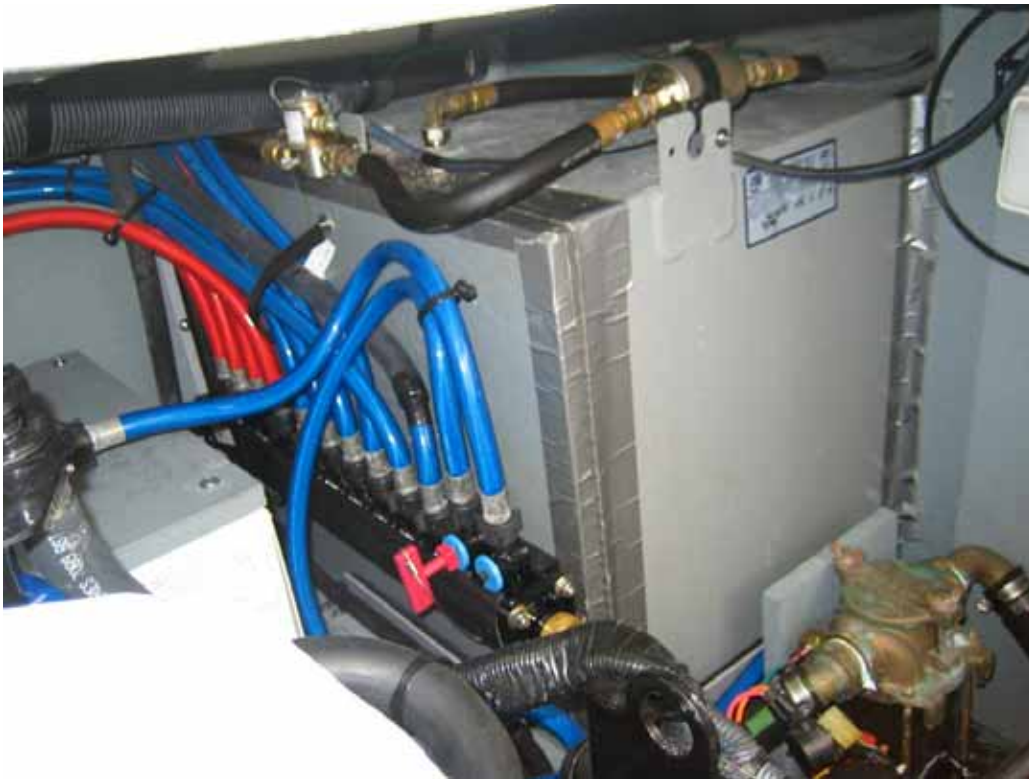
Photo 13. Port side 100 gallon fuel tank properly labeled and vented per ABYC Standards. Fuel hoses are Coast Guard approved and in good condition. Fresh water hot/cold manifold in foreground.

A reportedly 40-gallon polyethylene water tank was noted to port securely mounted with no signs of leakage in engine room. Another reportedly 28-gallon polyethylene waste holding tank was noted to port securely mounted with no signs of leakage in engine room. Pumping of house fresh water system is accomplished by a 12 VDC demand pump tested operational.