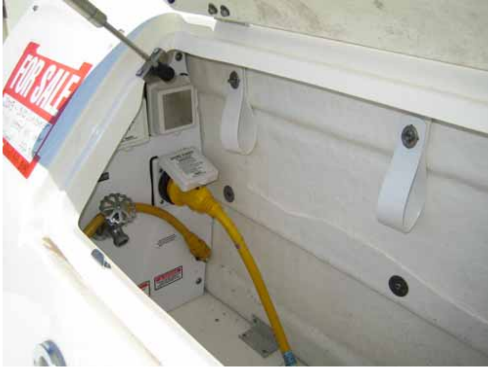
Photo 17. Inlet for 30A power installed to ABYC Standards and tested operational with multi-meter.