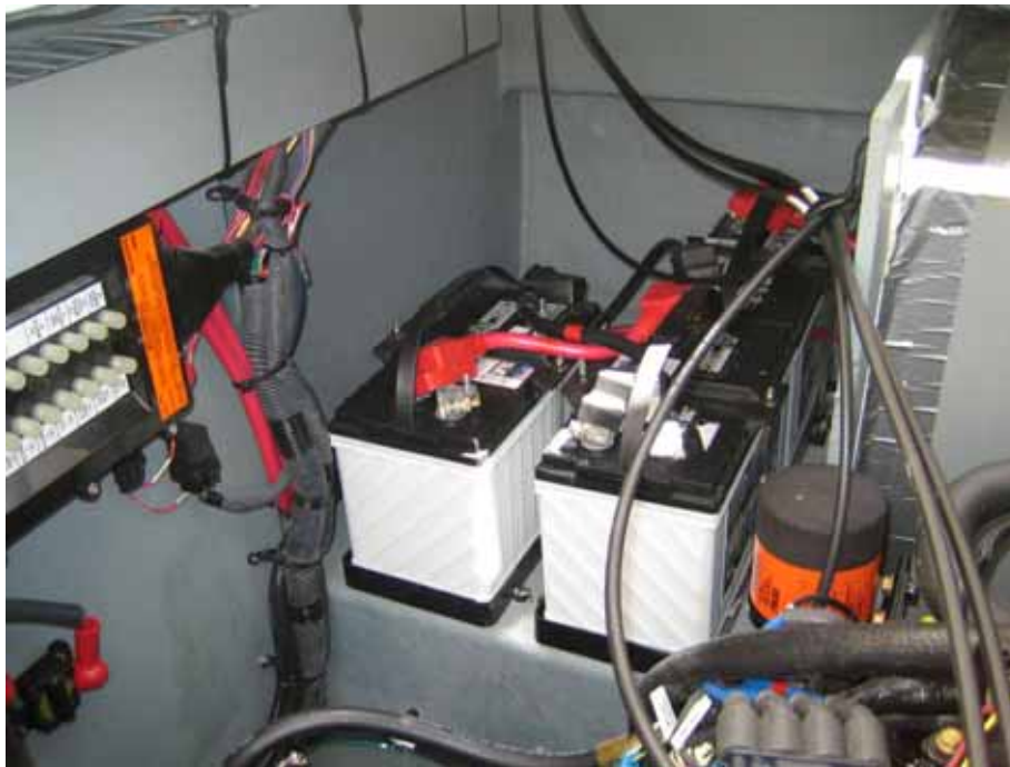
Photo 16. Three group 27 batteries were noted to starboard in engine room secured with positive terminal covered as per ABYC Standards. One is the house battery and the other two are port and starboard starting.