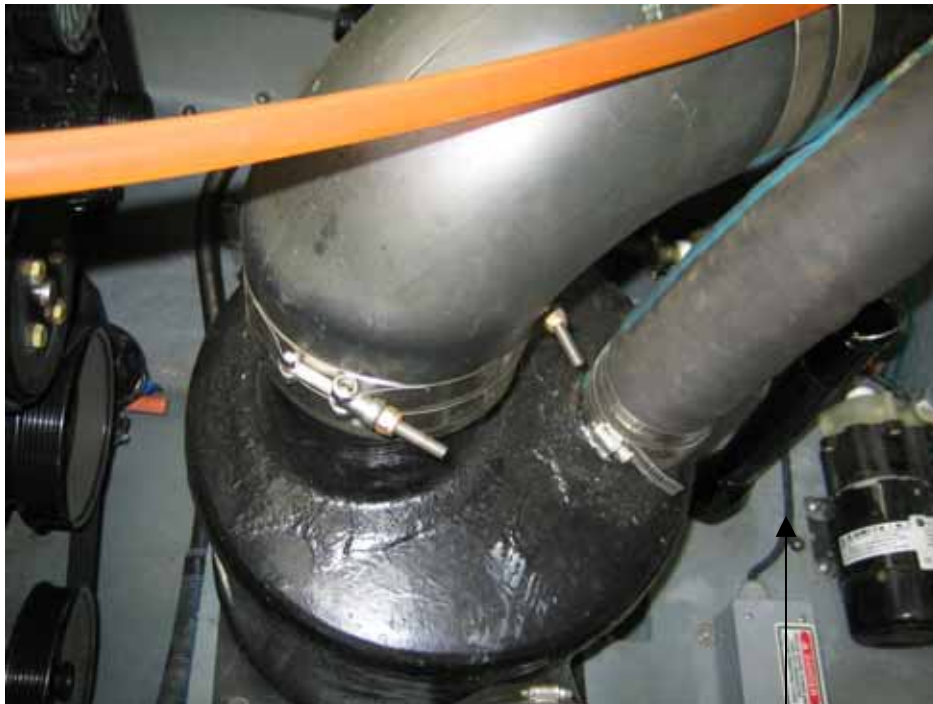
Photo 12. Aqua-lift fiberglass mufflers and hoses in good condition and double clamped.

Steering is accomplished by hydraulic Sea star steering system. .