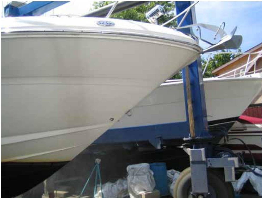
Photo 6. Close-up bow view and plow anchor on stainless roller.