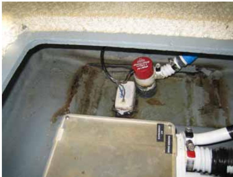
Photo 21. Bilge pump aft in engine room tested working.