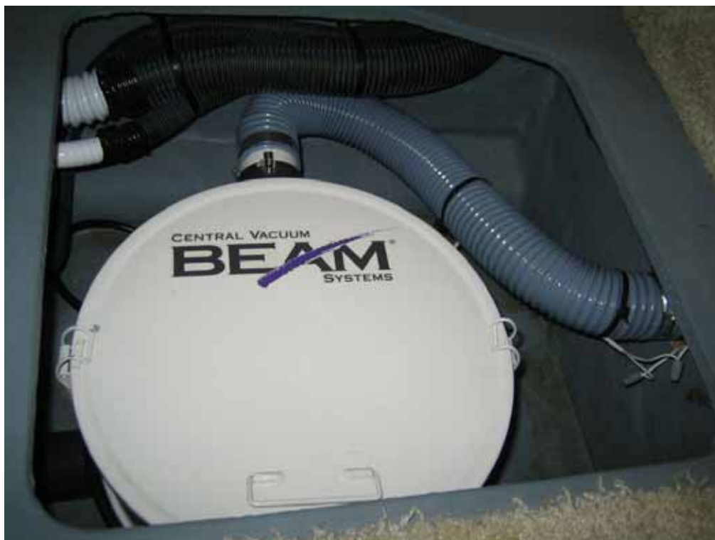
Photo 20. Central vacuum located under aft cabin seat.