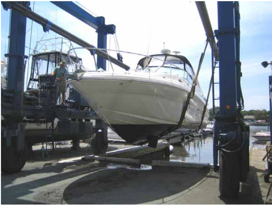
Figure 2. Starboard view.