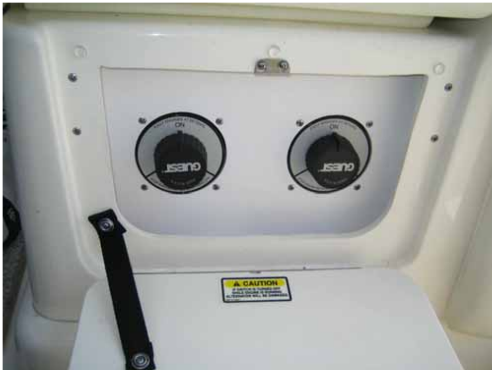
Photo 18. Battery switches under helm seat installed as per ABYC Standards.