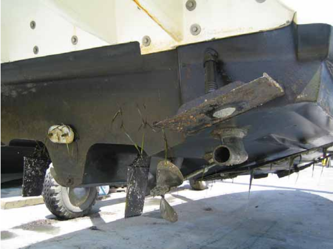
Photo 4. Close-up rudders, props, shafts, struts, trim tab, hull anode.

Anodes were noted in good condition and not due for replacement until next season.