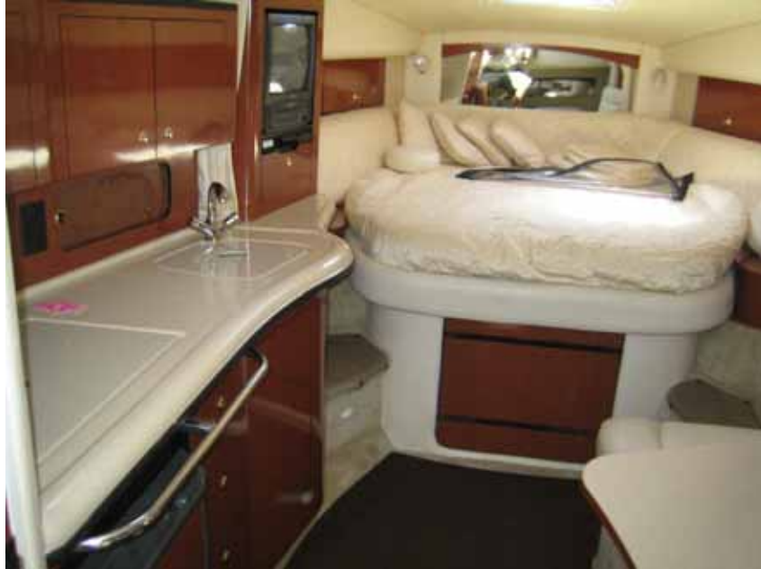
Photo 22. Galley to port.

A 12VDC/120VAC refrigerator/freezer installed in galley on port side was confirmed working as evidenced with pyrometer readings.