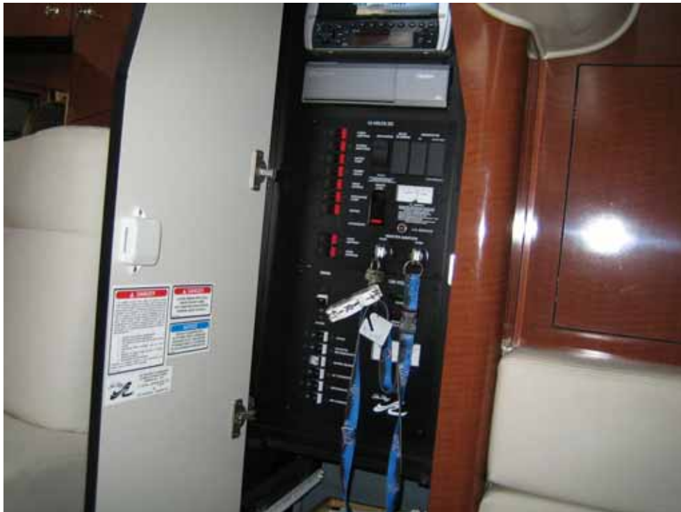
Photo 19. AC/DC breaker panel is installed in cabin as per ABYC Standards. Stereo visible above panel tested working.