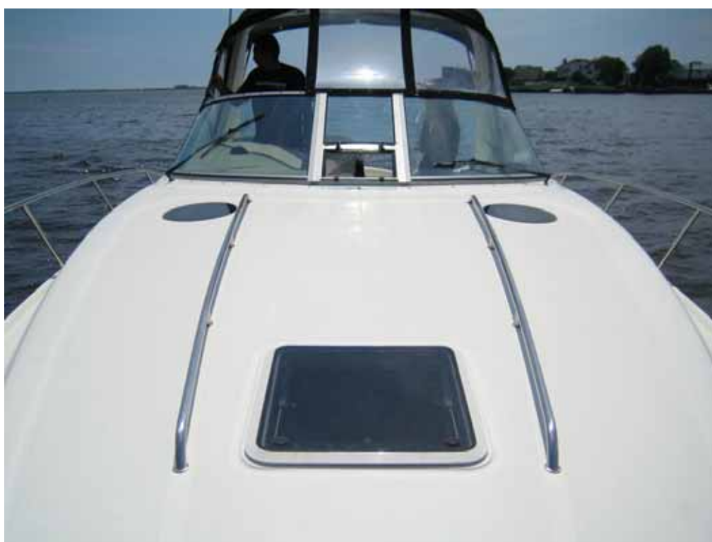
Photo 9. Foredeck looking aft.