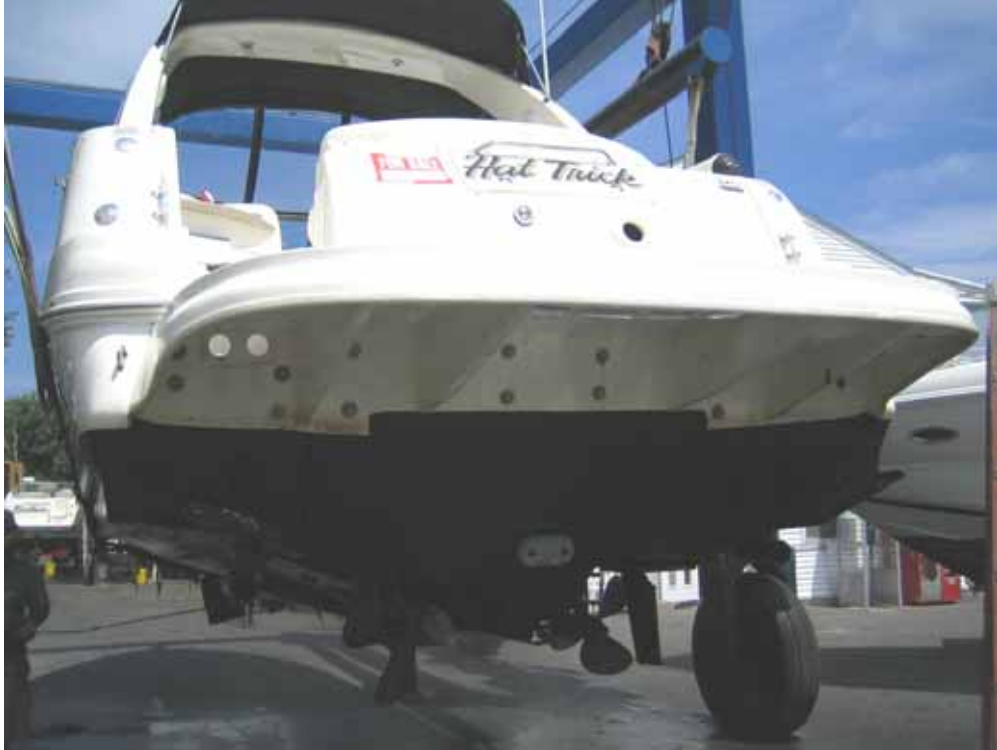
Photo 5. Stern view.