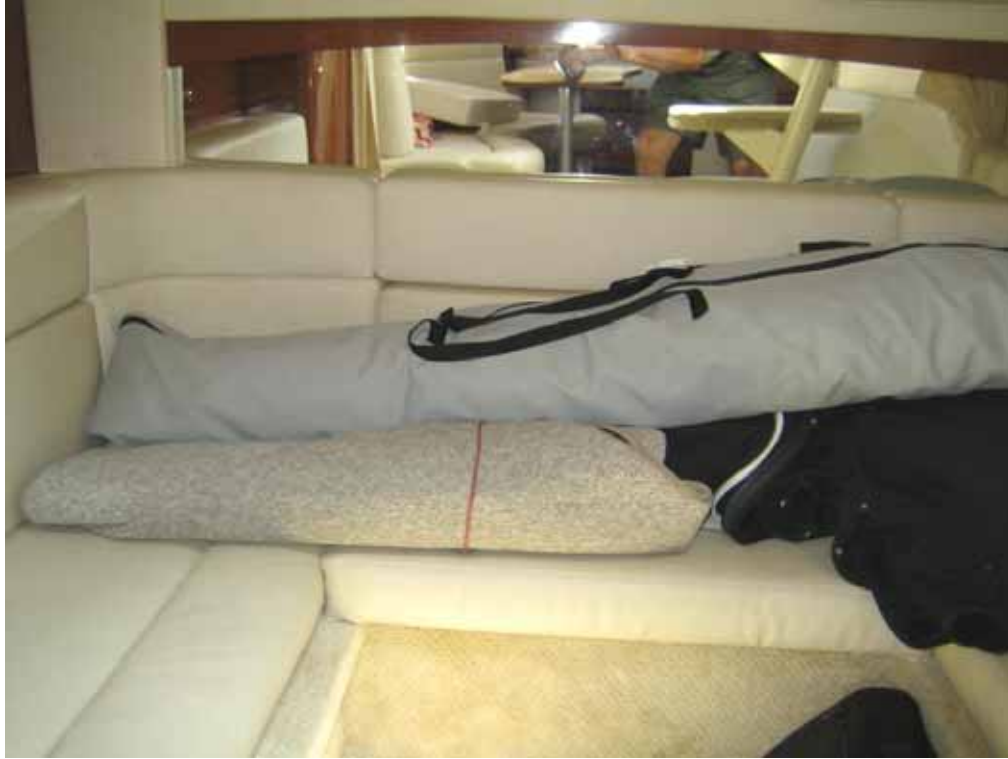
Photo 26. Aft cabin.

A Whirlpool microwave was tested and found operational. A Toshiba TV/VCR was noted working in main cabin.