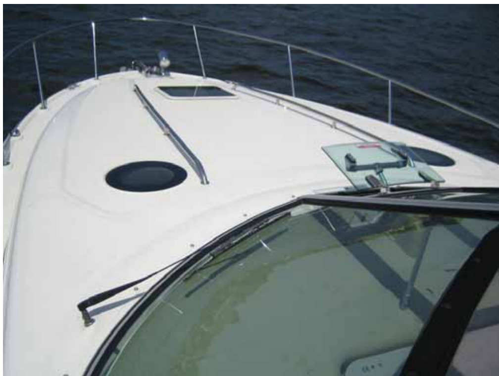
Photo 8. Foredeck.